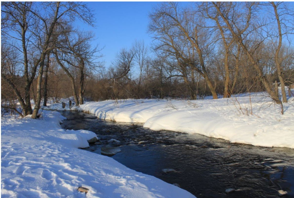
Pickerel Lake Outlet March 2010

Lowest recorded elevation 1838.2** Highest historical elevation 1848.2* Highest recent elevation 1848.0***