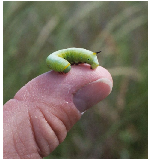
Bumblebee clearwing caterpillar