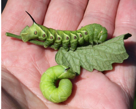
Five-spotted hawk moth or tomato hornworm caterpillars