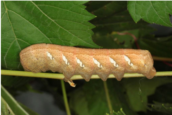
Above and below are variations of Pandora sphinx caterpillars