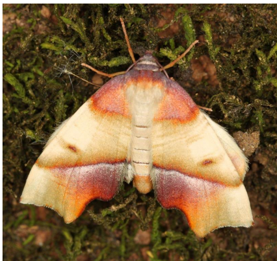
Straight-lined plagodis