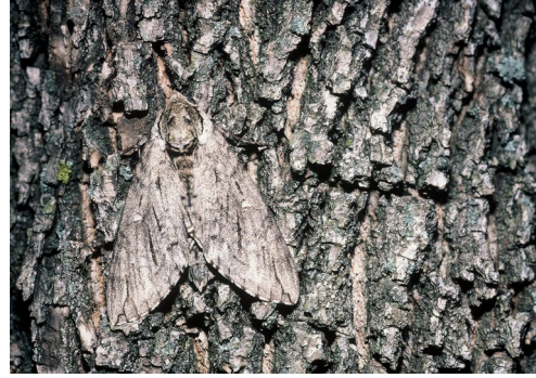
Underwing moth at rest