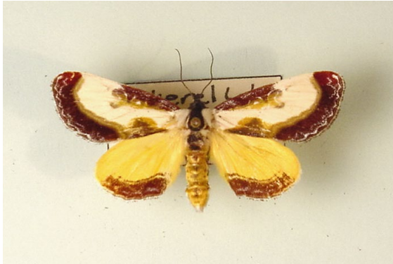
Beautiful wood-nymph (specimen by Dennis Skadsen)

Beautiful wood-nymph ( Eudryas grata ) Pearly wood-nymph ( Eudryas unio )