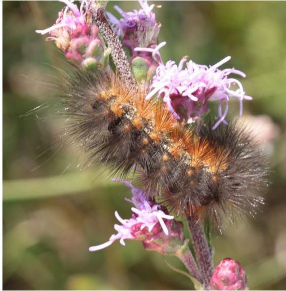
Grammia sp. Caterpillar (tiger moth)