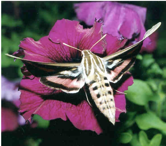
White-lined sphinx moth

The sphingidae are one of the better known and identifiable moth families. Several sphinx moths fly during the daytime. The White-lined sphinx (shown above) is sometimes mistaken for a hummingbird when observed feeding on petunias and other flowers. The Bumblebee or Snowberry clearwing (shown on page 4) mimics a bumblebee to gain protection from predators. Several other diurnal moth's