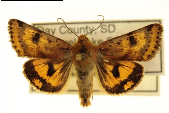
Orange phlox moth (specimen by Dennis Skadsen)

Orange phlox moth ( Heliothis acesias ) Prairie-sage flower moth ( Schinia cumatilis ) Hulst flower moth ( Schinia hulstia ) Leadplant flower moth ( Schinia lucens )