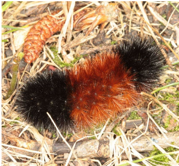
Woolly bear caterpillar (Isabella tiger moth)