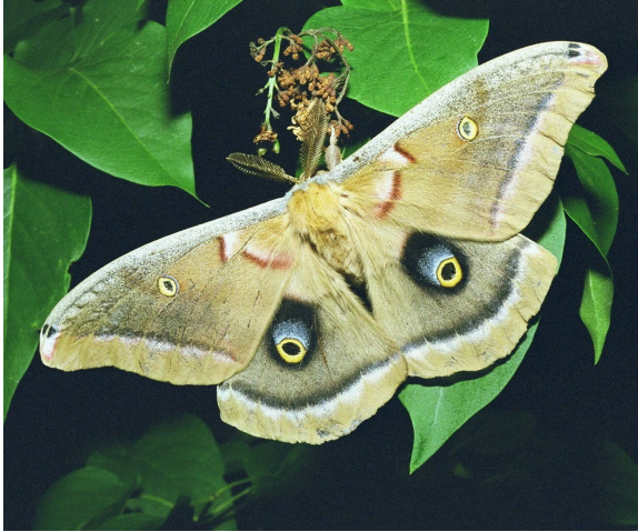
Polyphemus moth