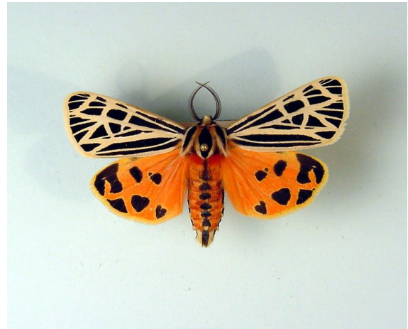
Virgin tiger moth (specimen by Dennis Skadsen)

Lesser milkweed tiger moth/Unexpected cyncia ( Cycnia inopinatus ) Dogbane tiger moth/Delicate cyncia ( Cycnia tenera ) Acrea moth/Saltmarsh caterpillar ( Estigmene acrea ) Parthenice Tiger Moth ( Grammia parthenice ) Virgin tiger moth ( Grammia virgo )