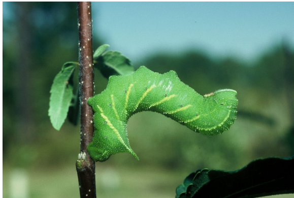
Twin-spotted sphinx caterpillar