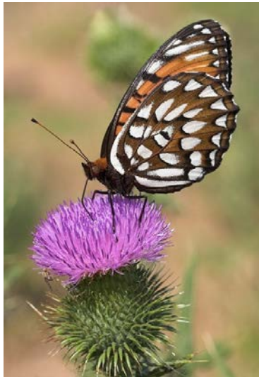
Regal Fritillary

Visit any native prairie in mid-July and you may observe all of the fritillary species listed above. Unfortunately, populations of one species the Regal fritillary, have declined in many parts of the United States due to the loss of native tallgrass prairie. Larvae of the Regal fritillary feed exclusively on prairie violets including Viola pedatifida and Viola nuttallii .