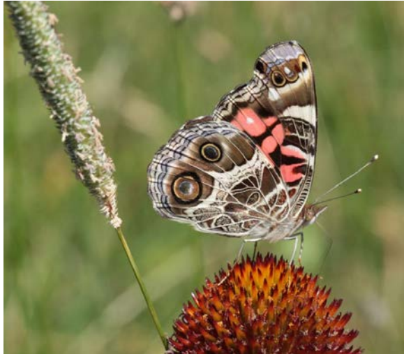
American Lady