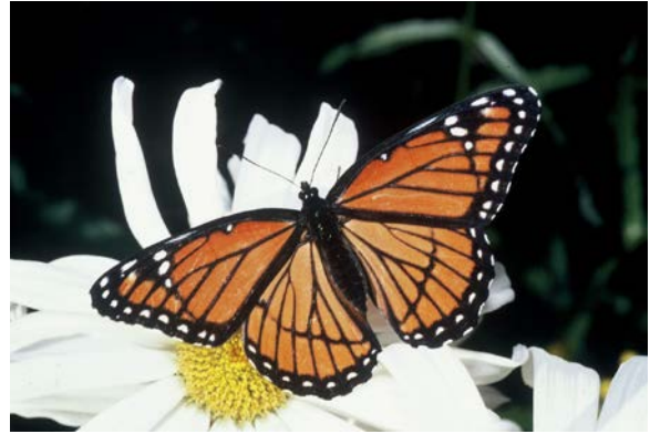
Viceroy

White Admiral ( Limenitis a. arthemis ) Red-spotted Purple ( Limenitis arthemis astyanax )