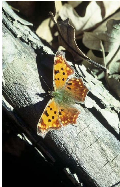
Eastern Comma

The brushfoots, one of the largest families of butterflies found in northeast South Dakota, are a diverse and unique group that includes two species, the Painted lady and Monarch that migrate as adults to southern climes in the winter; the Mourning cloak which overwinters as an adult by hibernating; and the Viceroy (pg. 5) a species that gains protection from predators by mimicking the unpalatable Monarch. The best areas to observe members of this butterfly family are Sica Hollow and Hartford Beach State Parks.