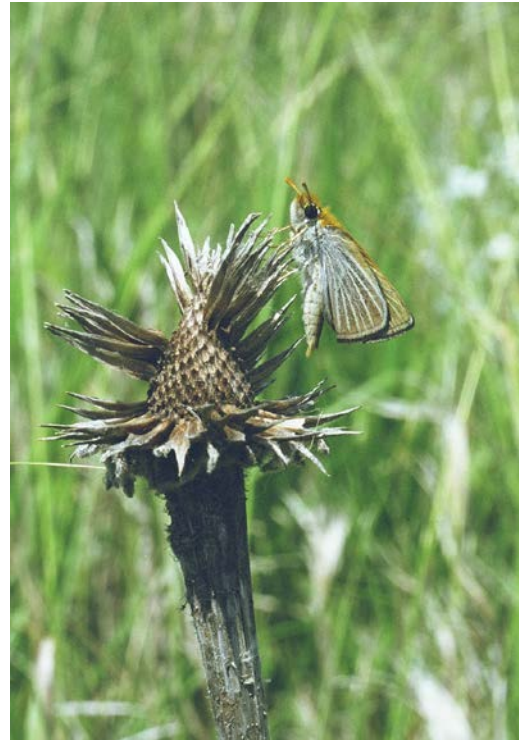
Poweshiek Skipperling

of the sites where specimens were collected in the past.