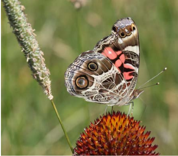
American Lady