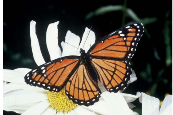
Viceroy

White Admiral ( Limenitis a. arthemis ) Red-spotted Purple ( Limenitis arthemis astyanax )