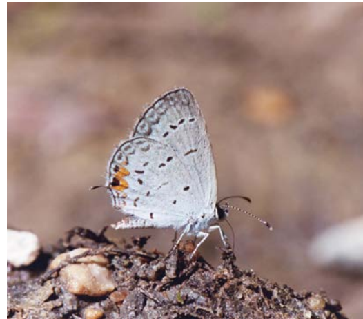
Eastern Tailed-Blue sipping water at Hartford Beach State Park

All three Lycaena species listed above can be found near streams, lakes, and wetlands making area parks and public wildlife areas good sites to find these butterflies'.