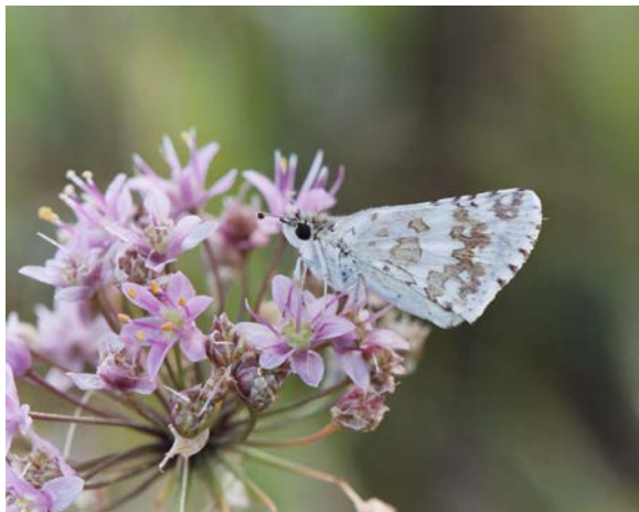
Common Checkered Skipper

Silver-spotted Skipper ( Epargyreus clarus ) Common Checkered Skipper ( Pyrgus communis )