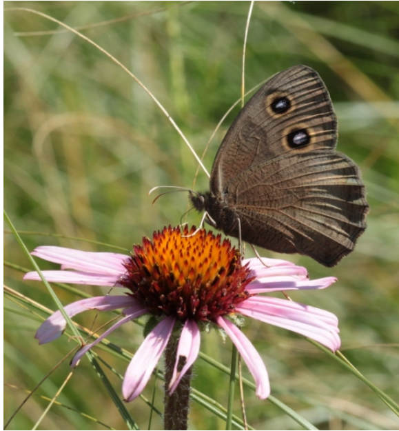
Common wood-nymph

Uhler's Arctic ( Oeneis uhleri varuna ) Monarch ( Danaus plexippus )