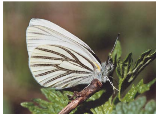
Mustard White – spring form