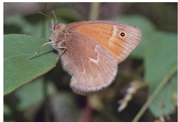
Prairie Ringlet

Viceroy ( Limenitis archippus ) Hackberry Emperor ( Asterocampa c. celtis ) Tawny Emperor ( Asterocampa clyton ) Northern Pearly-Eye ( Enodia anhedon ) Eyed Brown ( Satyroides eurydice ) Little Wood-Satyr ( Megisto cymela )