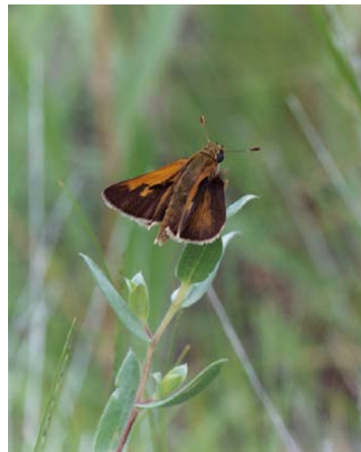
Tawny-edged Skipper

Poweshiek Skipperling ( Oarisma poweshiek ) Plains Skipper ( Hesperia assiniboia ) Leonard's Skipper ( Hesperia leonardus pawnee ) Dakota Skipper ( Hesperia dacotae ) Sachem ( Atalopedes campestris ) Peck's Skipper ( Polites peckius )