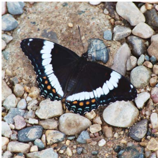
White Admiral

White Admiral ( Limenitis a. arthemis ) Red-spotted Purple ( Limenitis arthemis astyanax )