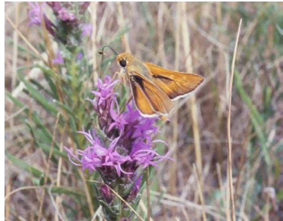
Leonard's Skipper nectaring on blazing star

Common Sootywing ( Pholisora catullus ) Least Skipper ( Ancyloxypha numitor )