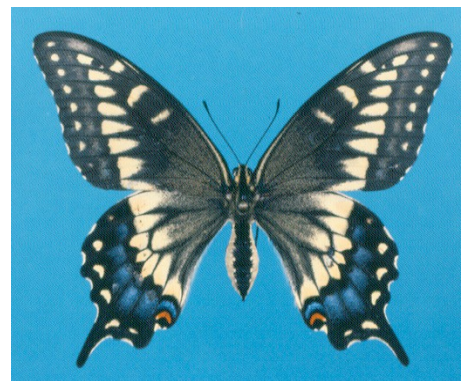
Old World Swallowtail (specimen by Dennis Skadsen)

These species are represented by less than three observations or specimen records for