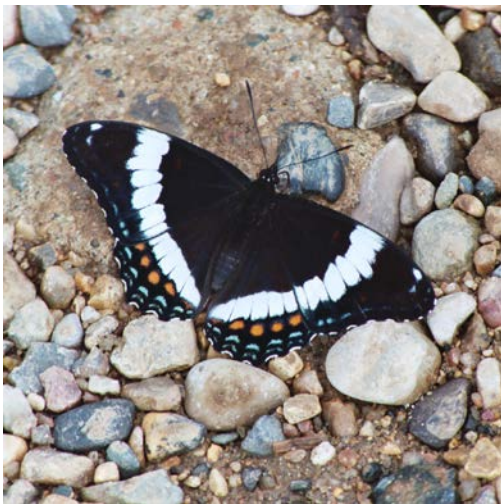
White Admiral

White Admiral ( Limenitis a. arthemis ) Red-spotted Purple ( Limenitis arthemis astyanax )