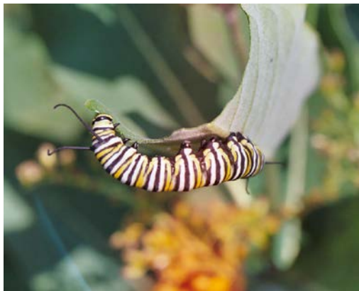
Monarch caterpillar feeding on common milkweed leaves

The life history of butterflies, as with most insects, involves a complex series of changes known as metamorphosis. Adult females lay eggs, most often on or near a specific species of plant or plants which the larvae will feed on. A larva or caterpillar hatches from the egg. The main purpose of the larval stage of a butterfly's life history is to eat and grow. Caterpillars often employ defense mechanisms to protect them from predators that include camouflage and warning coloration like the Mourning Cloak caterpillar (pg. 5).