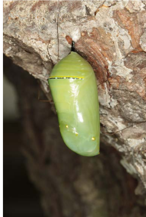
Monarch chrysalis

species is bivoltine, meaning two broods per year, or univoltine, meaning only one brood per year, determines how long before the pupa emerges as an adult butterfly.