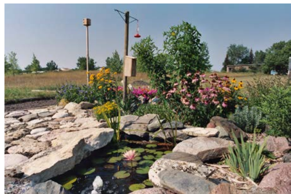
Butterfly garden located at the USDA Service Center - Webster, SD.

Another alternative to collecting butterflies, and an excellent way to observe and photograph butterflies in your own backyard, is to build a butterfly garden. A properly designed butterfly garden will offer plants suitable to the region to be utilized as sources of nectar for adults and food for caterpillars, rock and shrub piles to be used as overwintering habitat for adults and pupae, and water.