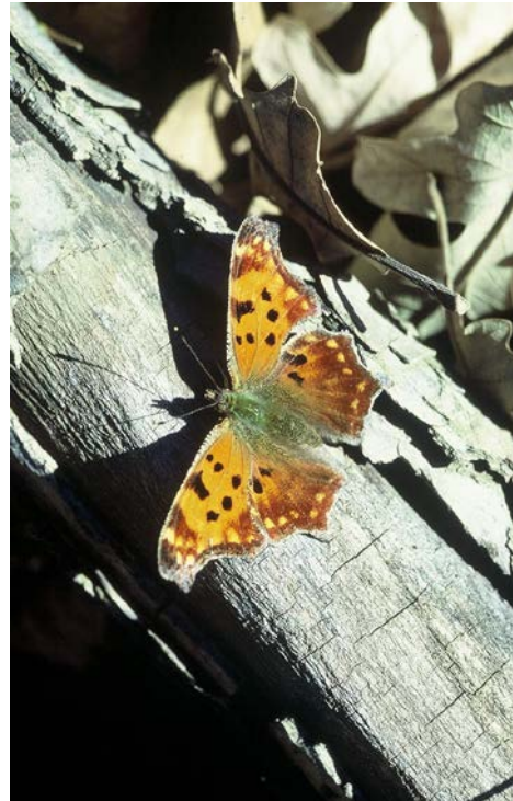
Eastern Comma

The brushfoots, one of the largest families of butterflies found in northeast South Dakota, are a diverse and unique group that includes two species, the Painted lady and Monarch that migrate as adults to southern climes in the winter; the Mourning cloak which overwinters as an adult by hibernating; and the Viceroy (pg. 5) a species that gains protection from predators by mimicking the unpalatable Monarch. The best areas to observe members of this butterfly family are Sica Hollow and Hartford Beach State Parks.