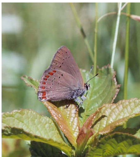
Coral Hairstreak

The blues, all except the Summer azure which is a woodland species, can be found on tame pastures, alfalfa fields, and native prairies. Most can be identified in the field using a good butterfly guide.