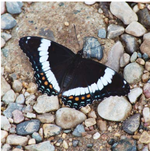
White Admiral

White Admiral ( Limenitis a. arthemis ) Red-spotted Purple ( Limenitis arthemis astyanax )