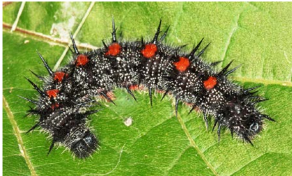
Mourning Cloak caterpillar