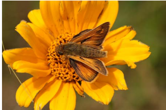
Dakota Skipper male on sunflower