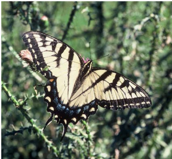
Eastern Tiger Swallowtail

Black Swallowtail ( Papilio polyxenes asterius )