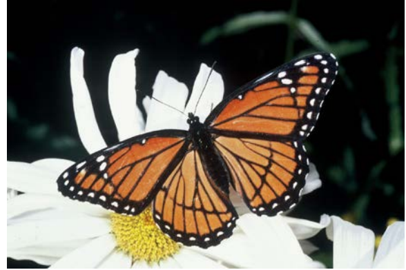
Viceroy

White Admiral ( Limenitis a. arthemis ) Red-spotted Purple ( Limenitis arthemis astyanax )