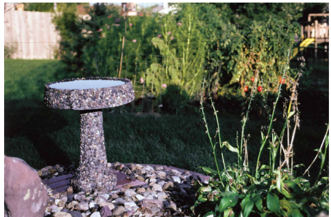
NRCS If natural sources of water are not available, birdbaths can provide water for many types of pollinators.

Pesticides, including herbicides and insecticides, do not discriminate between good species and bad species. An insecticide applied to eliminate a crop-eating insect may also kill valuable native pollinators. All groups of pollinators, as well as other wildlife, can be negatively affected or killed by pesticide use. Poisoning of pollinators may result from contaminated food (pollen and nectar), or directly from florets, leaves, soil, or other materials that may have come into contact with pesticides. Insecticide use should be reduced and herbicide use should be kept to a minimum to support the full range of native pollinators. Landowners should choose non-chemical or organic solutions to combat insect problems. If an insecticide is absolutely necessary, use the least toxic material possible, use it according to package directions, and treat plants at the time of day or period in the season when their flowers are not in bloom. Integrated Pest Management (IPM) is a critical component of safe habitat management for pollinators. For more information, see Fish and Wildlife Habitat Management Leaflet Number 24: Integrated Pest Management and Wildlife .