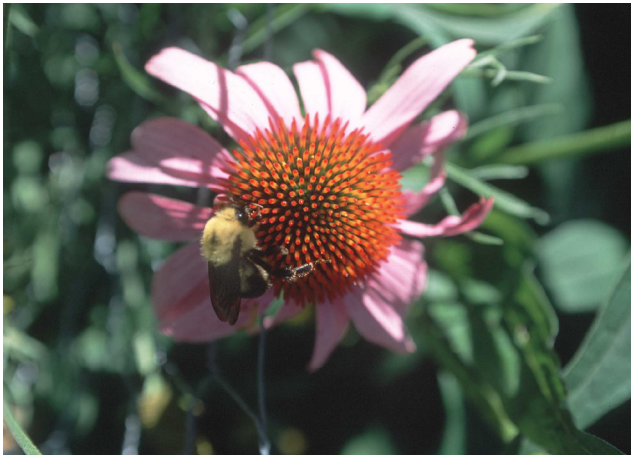
A bumblebee visits a purple coneflower.