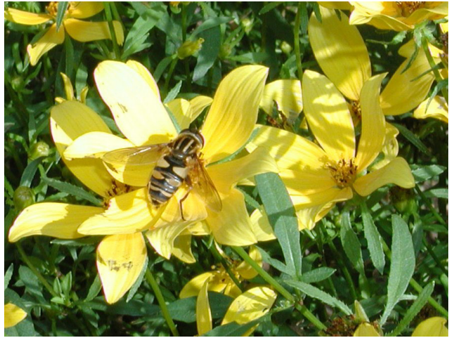
Charlie Rewa, NRCS

Flies and beetles are two important groups of native pollinators. Some flies resemble bees because they mimic bee coloration and patterns, allowing them to evade predation. Bees and flies both have transparent, membranous wings, but can be distinguished from one another because flies have two wings, while bees have four. Some pollinating beetles are quite small and difficult to see, resembling black specks on flowers, while others are large and colorful. There are hundreds of thousands of species of flies and beetles and many have yet to be identified. Habitat requirements vary from species to species. Flies and beetles require food, water, and cover in sufficient quality and quantity for each of their life stages (egg, larva, pupa, adult).