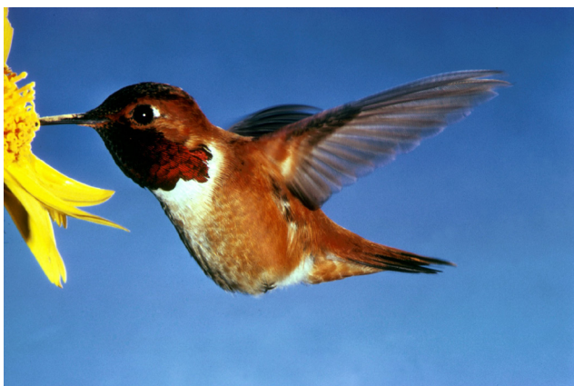
U.S. Fish and Wildlife Service

Hummingbirds are primarily woodland birds, occupying mixed woodlands, eastern deciduous forests, gardens, orchards, yards, overgrown pastures, citrus groves, scrub communities, hedgerows, and fence rows. They need trees, shrubs, and vines for shelter, shade, and nesting cover. Hummingbirds make their nests from downy plant fibers, such as thistle, dandelion, milkweed down, ferns, fireweed, young leaves, or moss, held together by spider silk and coated on