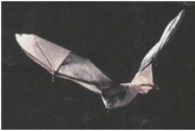
U.S. Fish and Wildlife Service

Many fruits rely on bats for pollination.