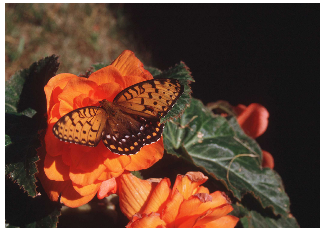
Butterflies are important pollinators of flowering plants.

After several weeks of eating and growing, caterpillars begin to transform into their adult forms. This transformation is called the pupa stage, and it is the non-feeding, stationary stage of a butterfly's life. Though they do not require food, pupae do need a protected site, such as a bush, tall grass, or a pile of leaves or sticks, on which to transform into their adult forms.